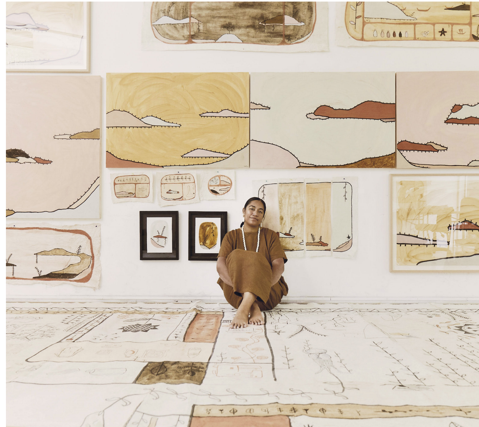
Artist photographed at Parehuia studio