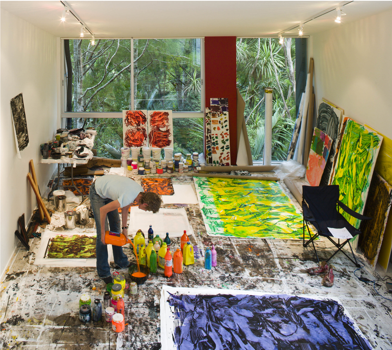
Artist photographed at Parehuia studio

"Having been the inaugural McCahon House resident I have held a connection with the residency programme since its inception and have seen it build into the prestigious and sought after residency it is today.