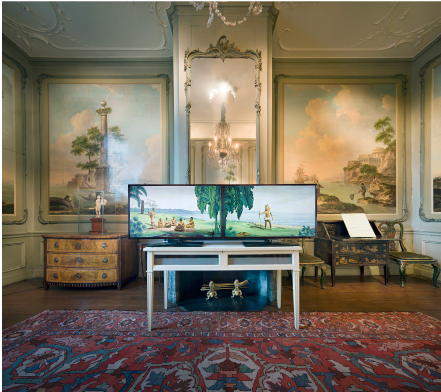
Early two-screen version of in Pursuit of Venus, installed at Museum Van Loon, Amsterdam, 2013

"Being a recipient of the McCahon Residency provided the time and headspace to create new works, and undertake research culminating in the video in Pursuit of Venus [infected] . These opportunities have long-lasting effects on one's practice and to community.