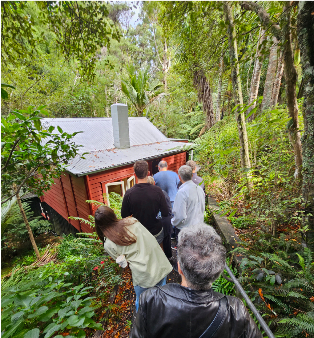
Graeme Burgess Museum Tour, 2024.

The McCahon House Museum, nestled amongst Kauri trees in the coastal foothills of Wāitakere Ranges, provides a point of entry into the life and work of Aotearoa's most preeminent painter.