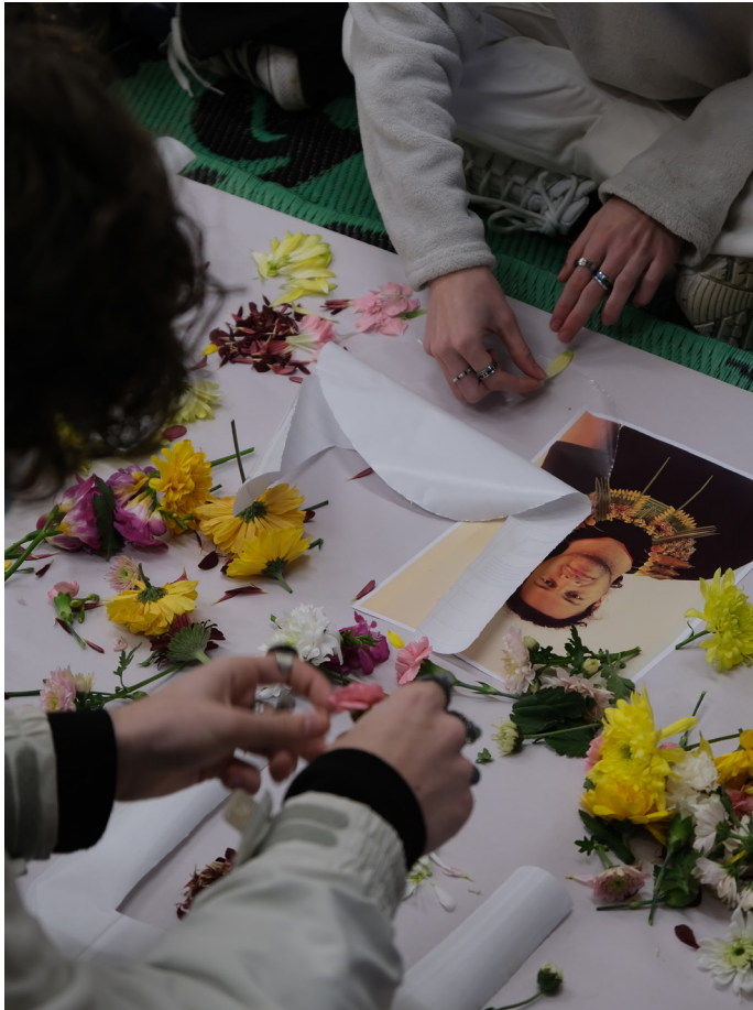
Avondale College student workshop, 2022

"I have heard first-hand from rangatahi how mysterious and impenetrable the art sector in Aotearoa can seem — they often have no idea how they would go about pursuing a career in the arts. Through the Creative Futures programme, McCahon House is offering something really tangible, pragmatic and inspiring to invite young people into the sector. Our goal of presenting videos from our artist residencies aimed at ākonga and aligned to the curriculum also provides another point of entry, allowing students to engage with contemporary practices and hear local artists talk about their work.