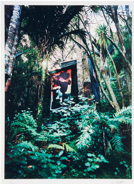
Emma Fitts For the Huntress at Parehuia , 2019 inkjet print on archival cotton fibre paper, edition of 3 460 x 340mm $1,000 (unframed)