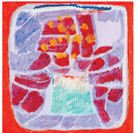
Nicola Farquhar E.M. March , 2019 pastel and acrylic on mattboard 460 x 460mm $3,000 (framed)